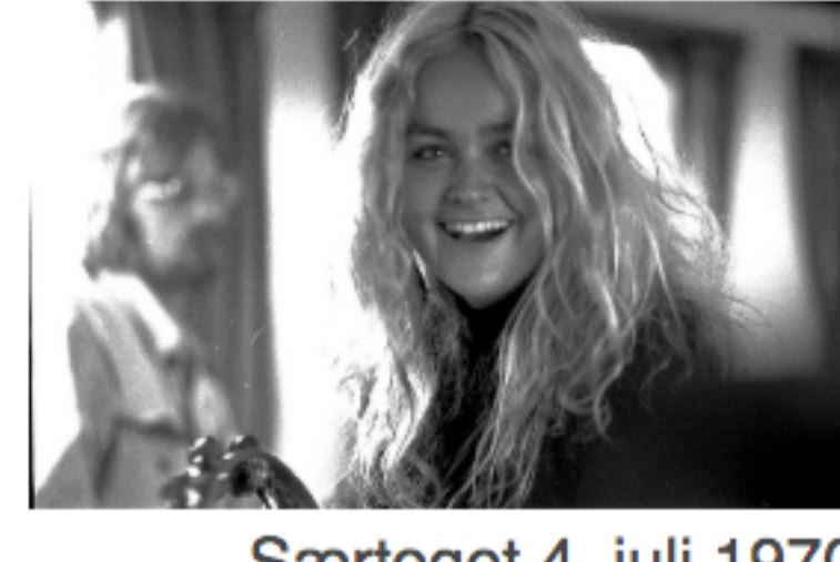
Særtoget 4. juli 1970