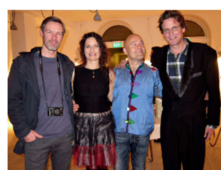
Reception på Hippie 1