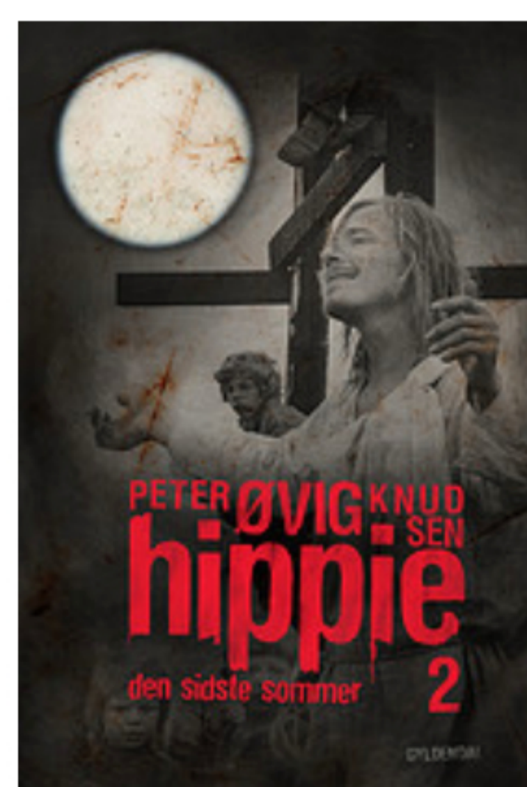
Hippie 2 På vej