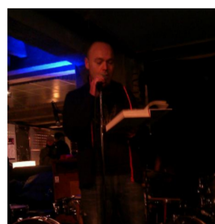
Billeder fra Musketer festivalen 2012