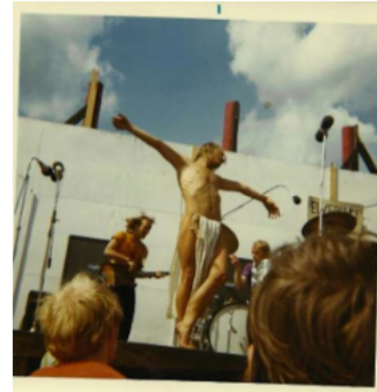
Charlotte Valløes billeder