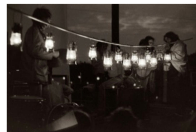
Musik og Dans