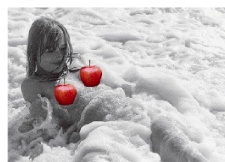
Censurerede billeder i Hippie 1 og 2