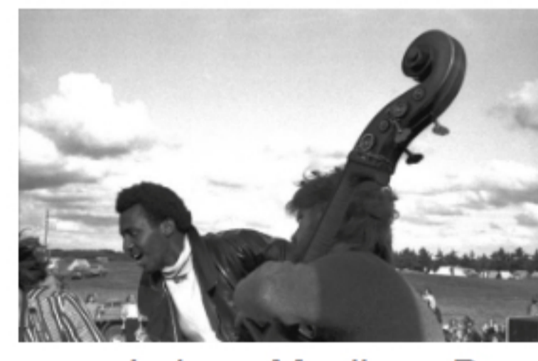
Lejren: Musik og Dans