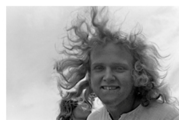
Glæde ved -